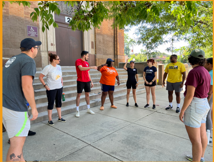
Salesforce Chicago playing a bit before beautifying the recess space at Madison Elementary