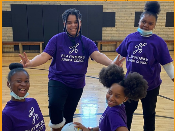
Till Elementary Junior Coaches learning new games to lead at recess