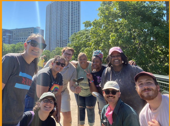
The Illinois team celebrating the end of the year at Diversy Driving Range